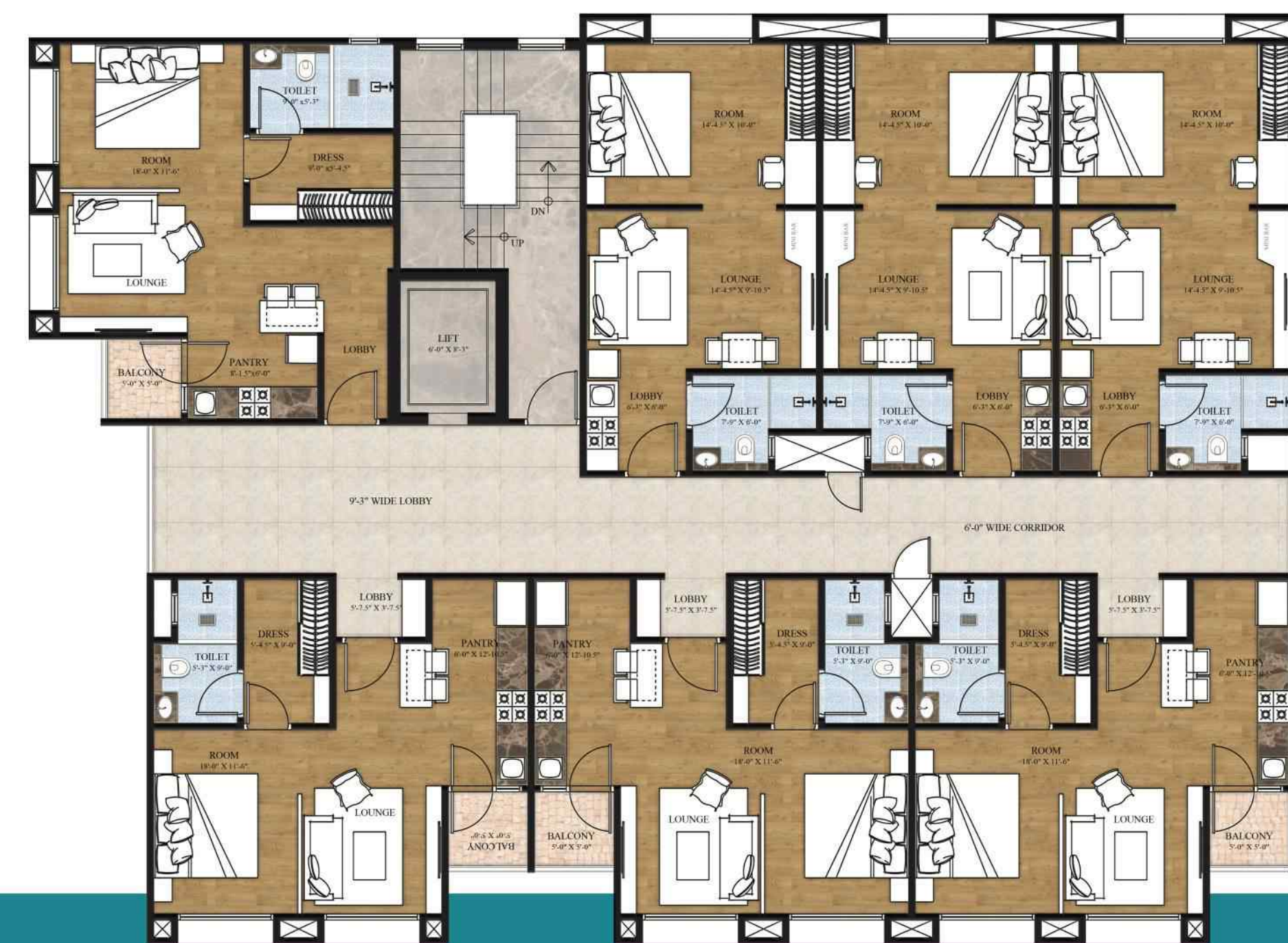
TYPICAL (2ND TO 4TH) FLOOR PLAN